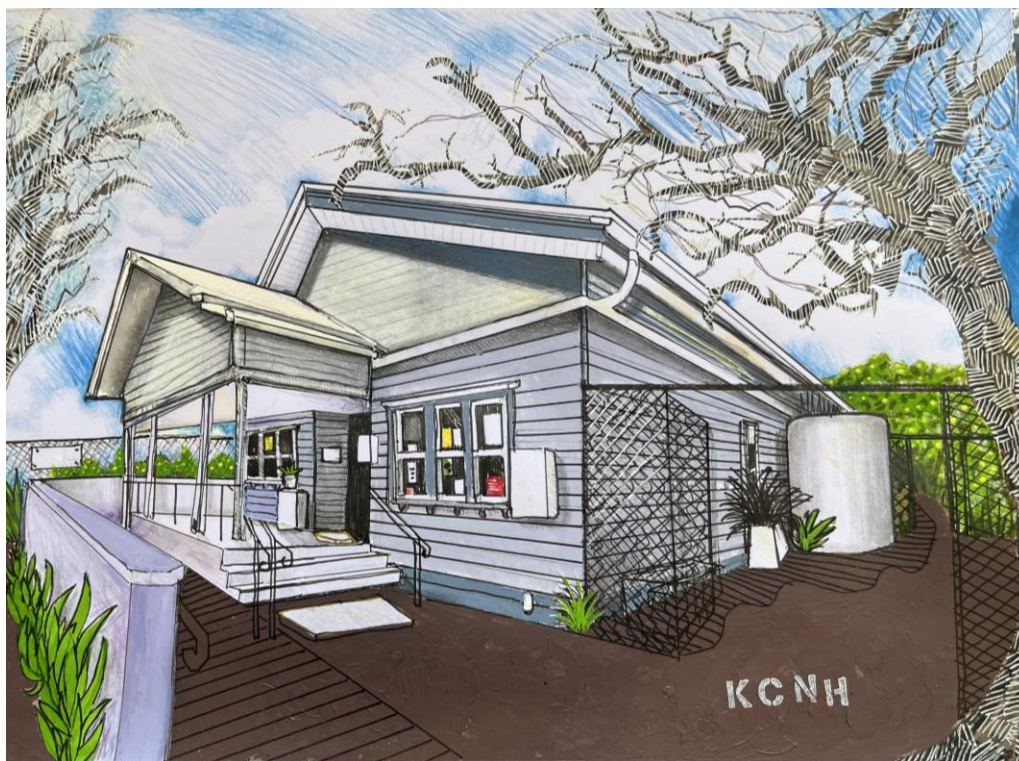
Illustration – Annie Paliwal